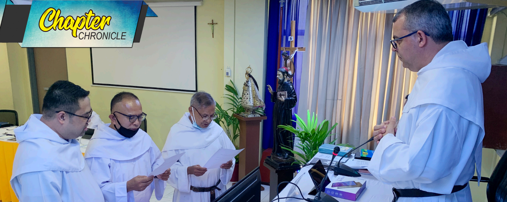
TELLERS DON'T TELL. Appointed Tellers of the Chapter swore an oath of secrecy in front of the President of the Chapter after the opening of the 8th Provincial Chapter.